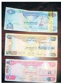
Few of the seized counterfeit notes.